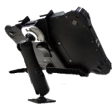
Vehicle mount holder